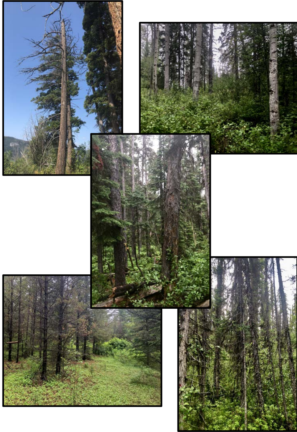
Figure 1.2. Example of common forest types found in and around the John Prince Research Forest in north-central, British Columbia, Canada. Outer (clockwise from the top left): Mature warm and dry Douglas-fir site, moist aspen stand, saturated bog-like black spruce stand (note the presence of the bog species Labrador tea ( Rhododendron groenlandicum )) and mature open park-like lodgepole pine stand. Centre: Typical predominant hybrid spruce-fir stand.