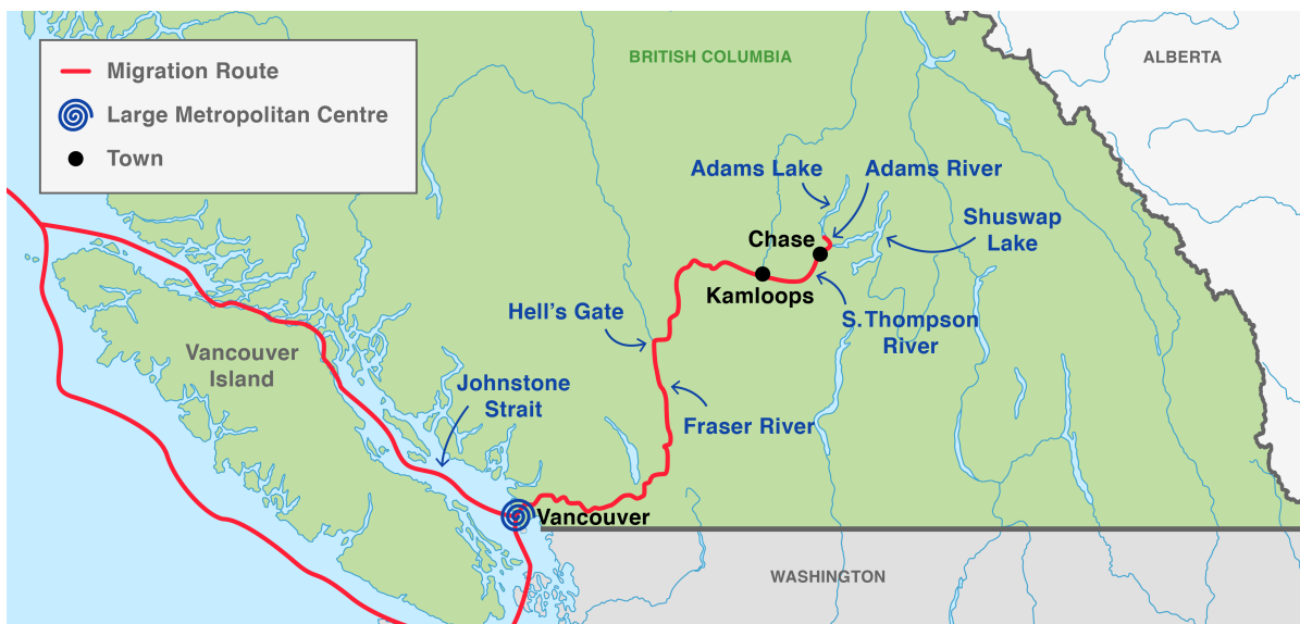
Figure 2 - Map of Southern British Columbia and the four-year migratory route of the Adams River sockeye salmon. Beginning at the Adams River in the interior of British Columbia, salmon move downstream through to the Thompson and Fraser Rivers and out into the Pacific Ocean. They return via the Johnstone Strait or outer Vancouver Island, to the mouth of the Fraser River and back upstream through the Fraser and Thompson Rivers to the Adams River (Quinn, 2005). Illustration by Alexis Shuffler (2020).