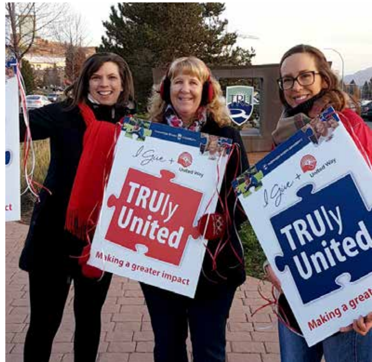
TRUly United champions kicked off the fifth annual campaign on Oct. 30.

Assistance through TRUly United supports programs like the United Way Rent Bank and the Clearwater Trails program. Donations are also directed to student scholarships and bursaries through the TRU Foundation.